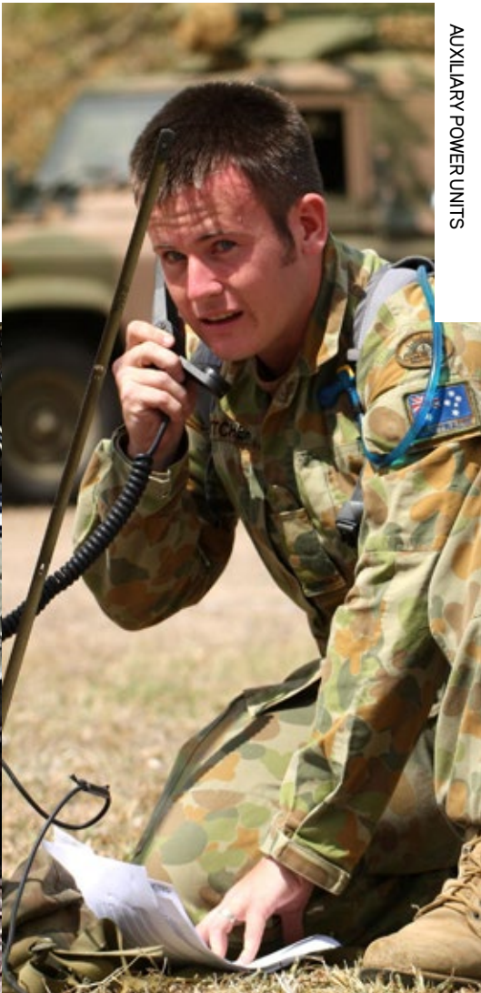
AUXILIARY POWER UNITS