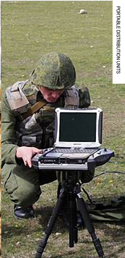
PORTABLE DISTRIBUTION UNITS